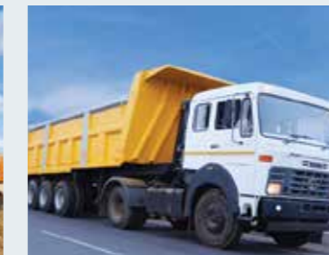
Trailers 10 Units