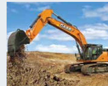
Excavator 2 units