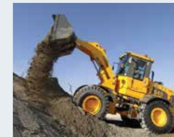
Loader 3 units