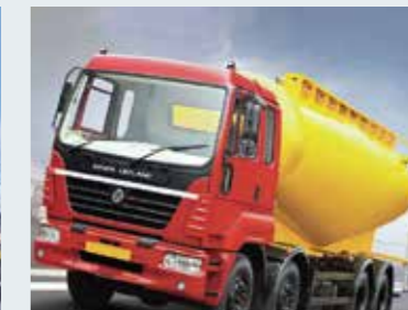
Bulker Trucks 5 units