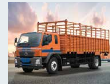
Trucks 6 Units